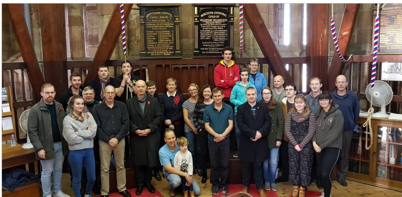
Ringers on Sunday 11 November 2018 on the 100th anniversary of the Armistice ending the Great War

The Cathedral is the only church with an harmonic minor ten. Rung half-muffled on Good Friday, Armistice and Remembrance Days and New Year's Eve, their haunting sound reminds the living of their mortality and is the call of the dead to be remembered.